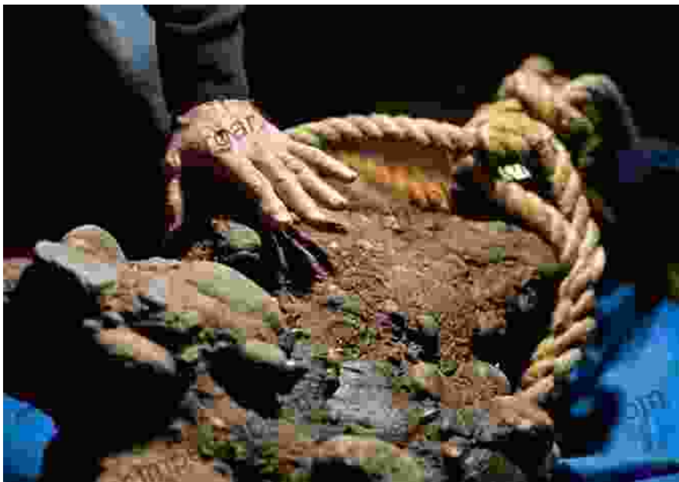
Artifacts recovered from the Whydah pirate ship