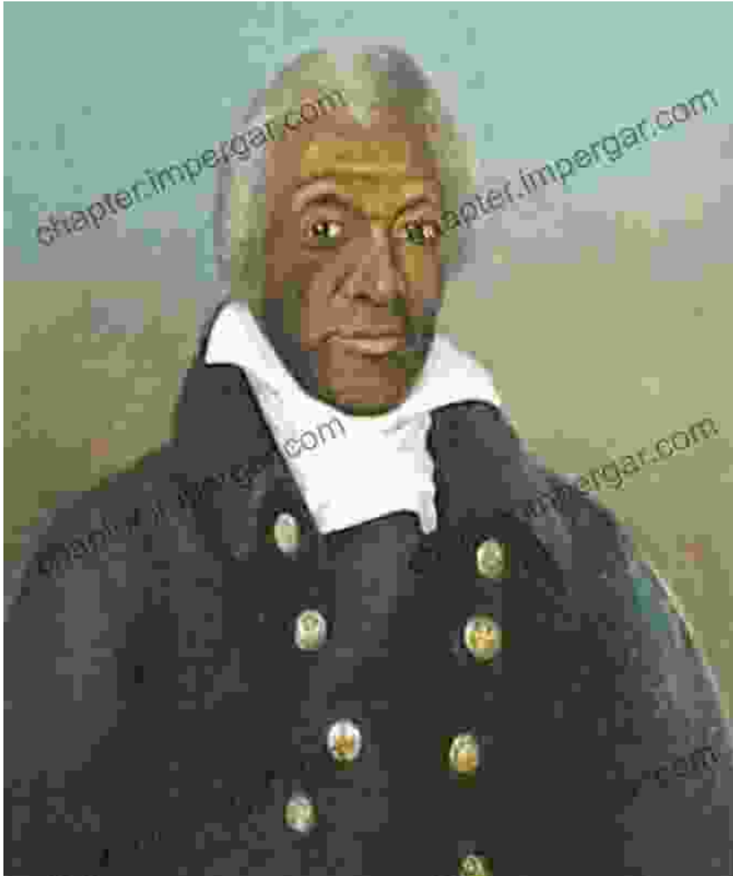
James Armistead Lafayette, a skilled and daring espionage agent.

also examines the role of code-breakers like Benjamin Tallmadge, whose deciphering of British communications enabled American forces to anticipate enemy movements.