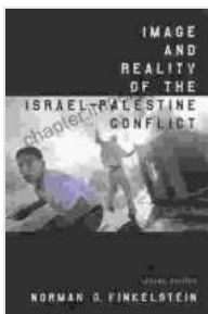
Image and Reality of the Israel-Palestine Conflict

This book is a must-read for policymakers, scholars, students, and anyone interested in the Israel-Palestine conflict. Its insightful analysis, thought-provoking perspectives, and commitment to understanding make it an indispensable guide to one of the most pressing challenges of our time.