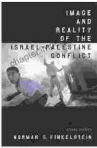
Image and Reality of the Israel-Palestine Conflict