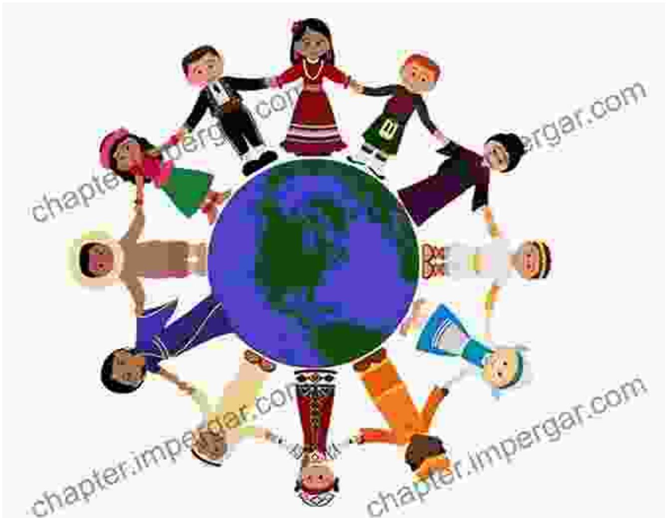
Image showcasing the diverse range of languages and cultures around the world.