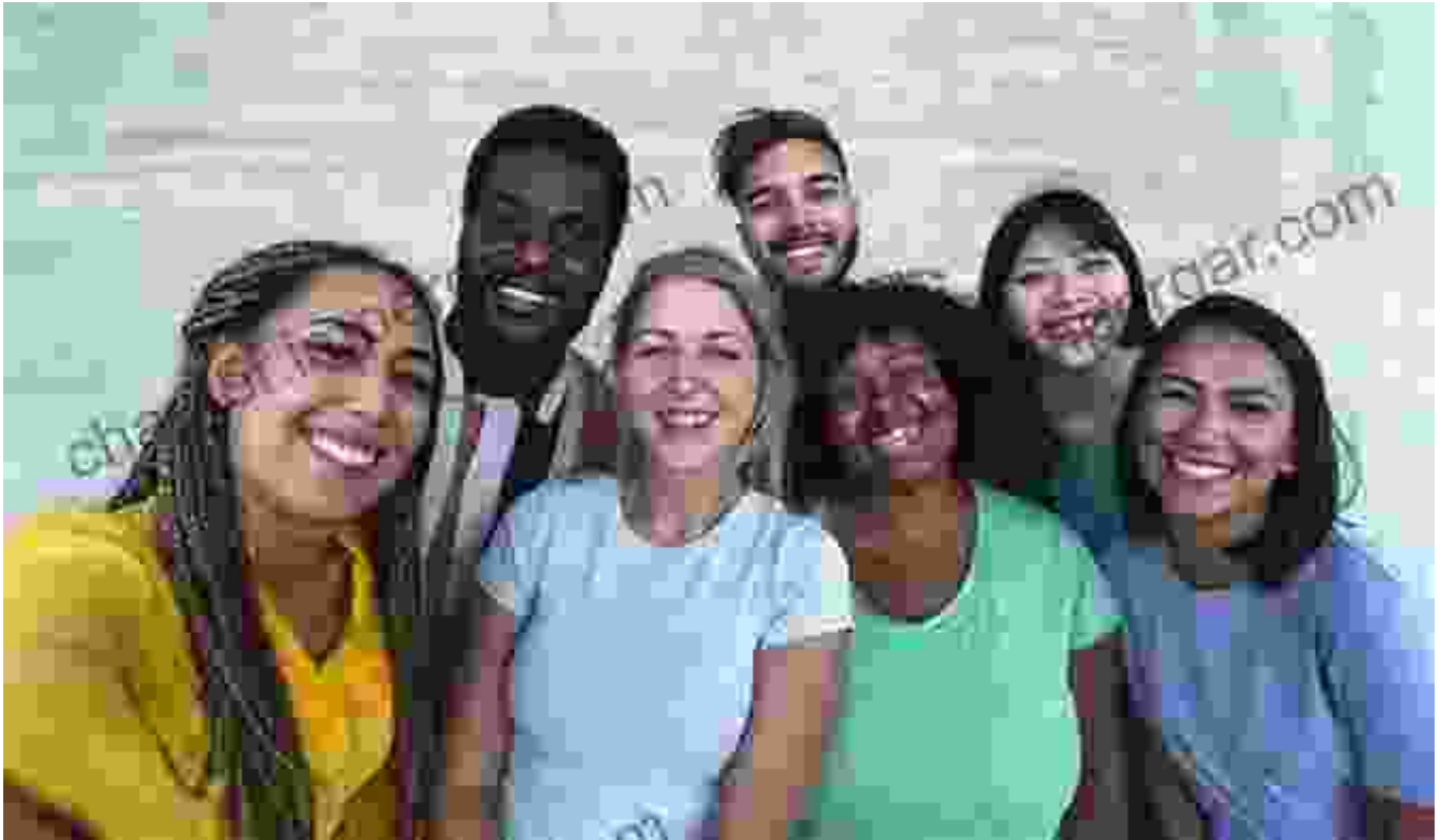
Image representing the diversity of cultures and identities around the world.