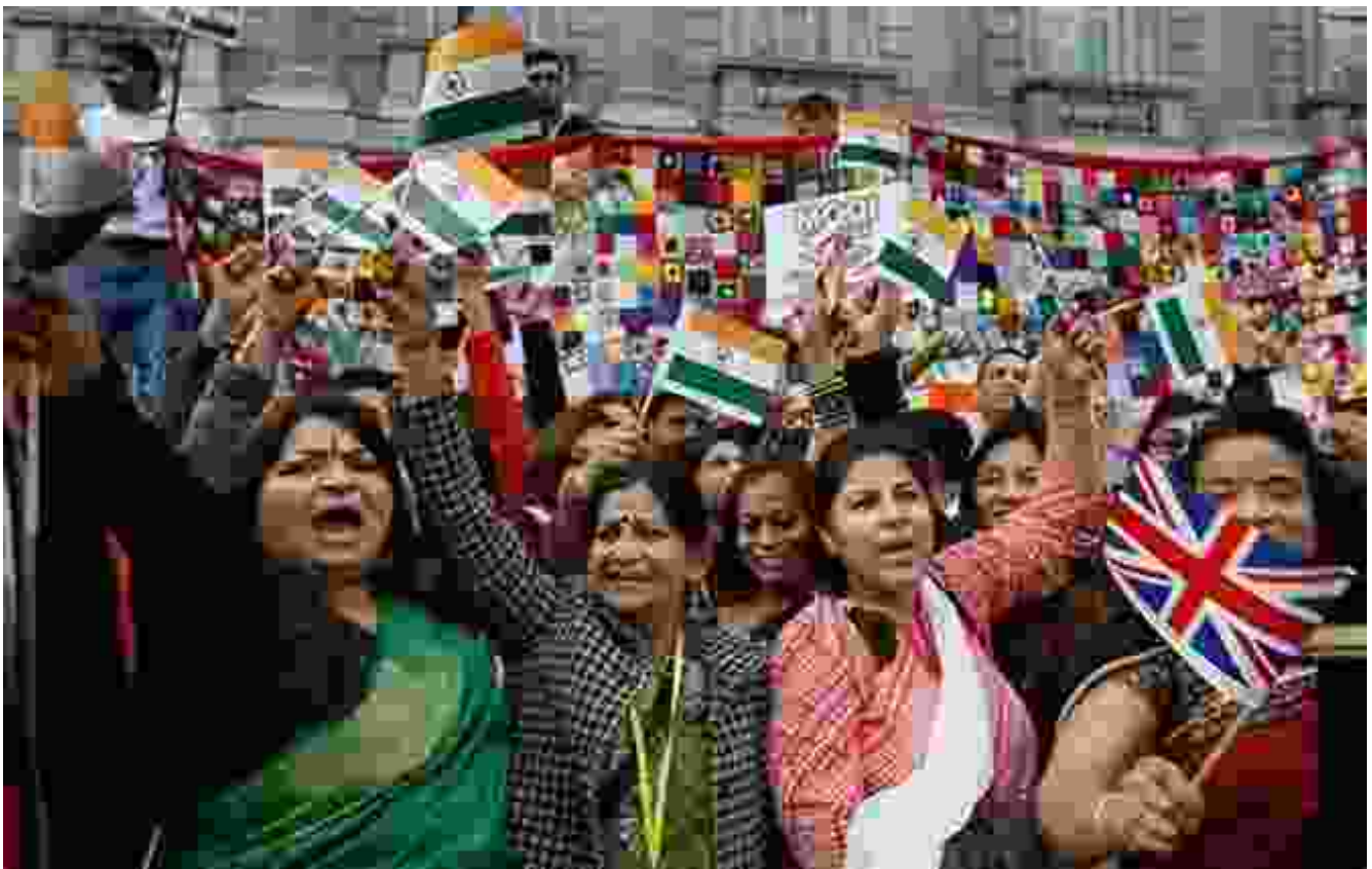
Community Outreach by the Indian Diaspora

The Indian diaspora in Dubai has given rise to numerous success stories. From renowned entrepreneurs who have built billion-dollar businesses to healthcare professionals, educators, and artists who have made significant contributions to their adopted city, their achievements are a testament to their talent and dedication. As they continue to thrive, they also actively engage in philanthropic efforts, supporting underprivileged communities both in Dubai and India.