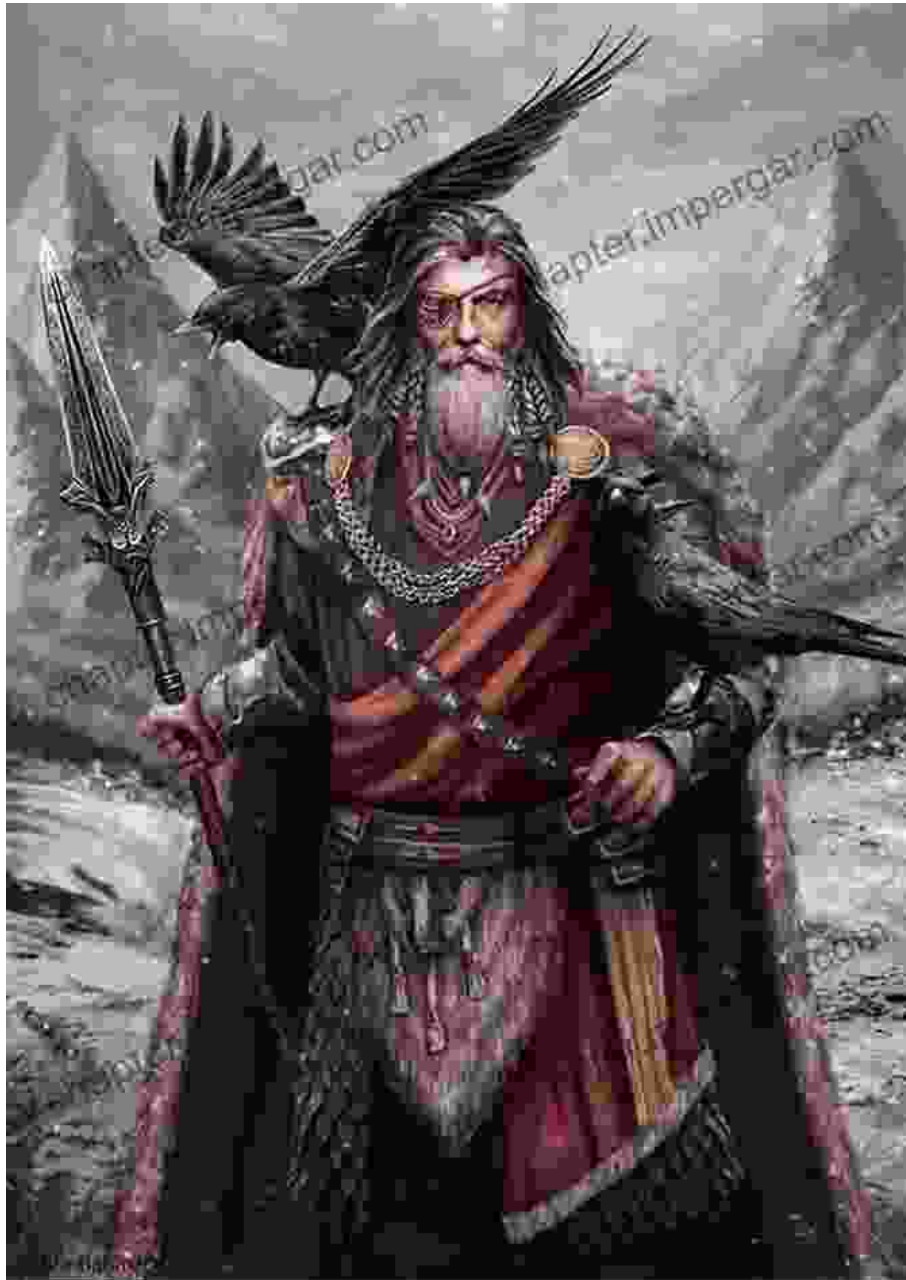
Figure 1: The Norse gods Odin, Thor, and Loki